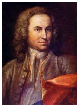
The Young Bach