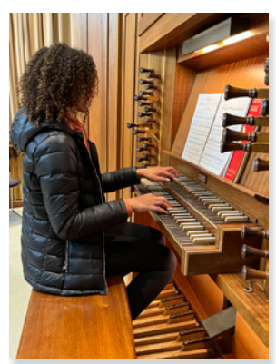
A participant at PODD 2023

Pipe Organ Discovery Day provides students in grades 3 through 12 with an opportunity to learn more about the pipe organ and expand their knowledge with hands-on experience on a variety of instruments. The event is free to participants and family members are welcome. Prior keyboard experience is needed to play the instruments; all are welcome to come and learn. A pizza lunch is provided courtesy of the TCAGO.