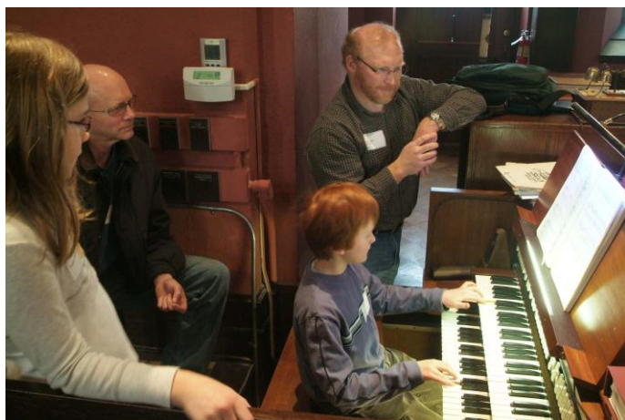
A young piano student plays the Saint Clement's organ

On Saturday, February 26 th , Saint Clement's Church hosted a Pipe Organ Discovery Day for ten piano students with their families. The Pipe Organ Discovery Day is an annual event organized by the Twin Cities Chapter of the American Guild of Organists (TCAGO), designed to introduce young piano students to the organ.