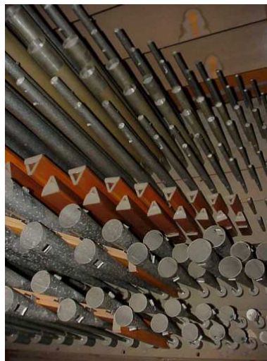
Northrup organ Swell pipes