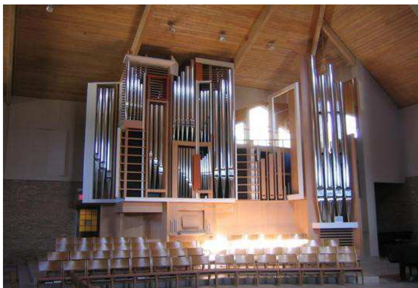
Glatter-Götz/Rosales organ, Augustana Lutheran Church

Augustana's Glatter-Götz/Rosales organ has 2 manuals, 39 stops, mechanical key action and electric stop action. The church is located at 1400 S. Robert Street, West St Paul. There is no admission charge for the concert. A Free-will offering will be received. □