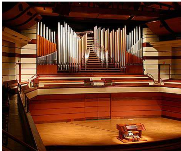
Blackinton organ, Benson Great Hall, Bethel University