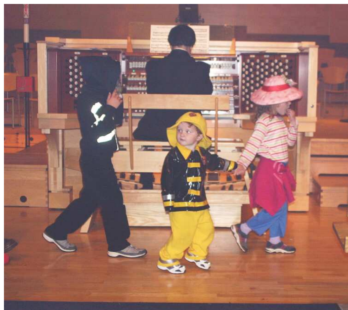
Halloween Costume Parade at St. Andrew's