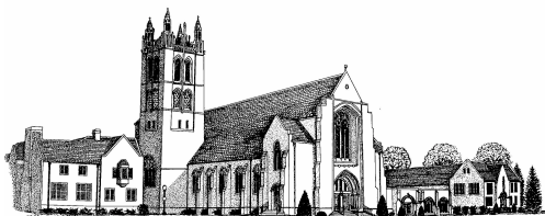
House of Hope Presbyterian Church, St. Paul, Minnesota