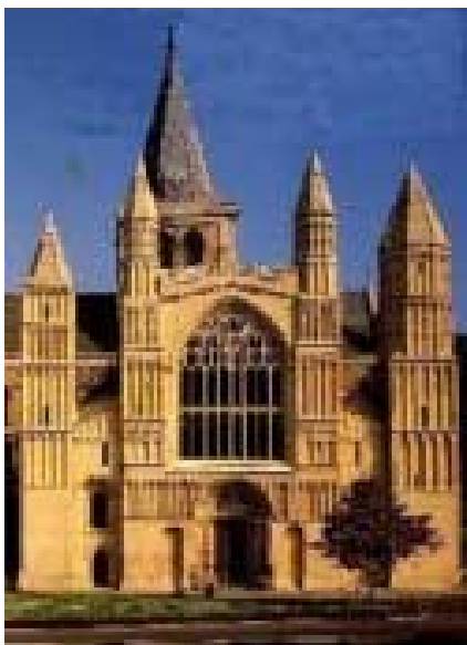
Rochester Cathedral, England

On Sunday afternoon, May 18 at 4:00 pm , choristers of the House of Hope Choir School (797 Summit Avenue, Saint Paul) will offer a concert entitled "Extraordinary Ordinaries." The performance is so named because it will explore multiple musical settings of the unchanging texts of the ordinary of the Mass, evensong and morning prayer.