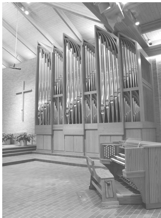
Schantz organ, St. Philip the Deacon Lutheran Church

The organ is fully encased with pipes from the Great 8’ Principal, the Pedal 16’ Principal and Choralbass in façade. Since the choirs at St. Philip’s sit to the side of the instrument, the expressive divisions have both “nave” and “side” shutters with independent control. Windpressures range from 4” in the Great to 12” for the commanding Trompette de Fête of the Choir division. There are three 8’ Principal stops on the manuals and mixtures for each manual division as well. Of particular note are the five mutations in the Choir division including the 1-1/7’ Septieme and the 8/9’ Neuvieme providing a wealth of colorful combinations. 19 of the Principal ranks are constructed of 85% tin with remaining stops of spotted metal, wood and zinc construction. The movable console features 99 levels of memory, a full complement of couplers, and a complete MIDI system with recording sequencer.